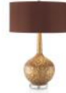
JRL-8907 31"H Marakesh Lamp 31"H Marakesh Table lamp. Dramatic gourd shaped stenciled table lamp with Indian floral design. Shade: 20.5"x20.5"x10" Brown. 3 way, 150 watt