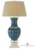
JRL-8766 33"H MATHILDE TABLE LAMP 33"H It is always great to be able to add a little touch of color with a lamp The Mathilde is an easy way to create a bit of drama and elegance with a