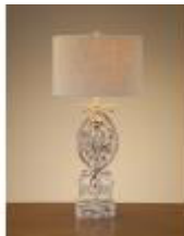
JRL-8197 28.5" Old Iron Rustic Lamp 28.5"H Old Iron Rustic Lamp Shade: (15" X 11") X (17" X 14") X 10" Light Beige Linen One-Way, 60 Watt Max, Type A Bulb Also Available With