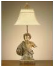
JRL-7548 37" Hf Broken Angel Comp Lamp 37"H Hand-Finished Broken Angel Lamp Shade: (9" X 9") X (18" X 18") X 11" French Beige Three-Way, 150 Watt Max, Type A Bulb Also