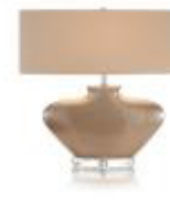
JRL-9123 21.5" Pearl Visions Table Lamp 21.5"H Pearl Visions Table Lamp. Powder coated oval aluminum body on oval acrylic base. Shade: (22x9)x(22x9)x8.25" Light Beige. 1 Way, 60 watt