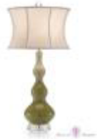
JRL-8919 33" Celadon Triple Gourd Lamp 33"H Celadon Triple Gourd. Celadon colored glaze over triple gourd. Shade: 16" X16" X 10" Ivory. 3 way 150 watt max, type A bulb. 8.5" Harp. Note: