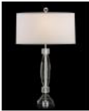
JRL-9110 32.5" Crystal Hexagonal Clmn Table Lamp 32.5"H Crystal Handcut Hexagonal Column Table Lamp. Handcut optical glass in hexagonal shape with polished nickel accents. Shade: