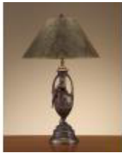
JRL-7869 31" Gone Fishin' Bronze Lamp 31"H Gone Fishin' Bronze Lamp Shade: 7" X 19" X 11" Hand-Finished Three-Way, 150 Watt Max, Type A Bulb Also Available With California Wiring