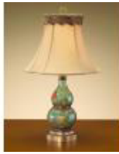
JRL-7449 23" Grn/Red/Gld Flower Porc Lamp 23"H Green, Red And Gold Floral Porcelain Lamp Shade: 7" X 14" X 10" Antique Gold Three-Way, 150 Watt Max, Type A Bulb Also Available With