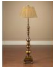
JRL-7892 65" Water Gilded Floor Lamp 65"H Water Gilded Floor Lamp Shade: 125" X 205" X 115" Pleated Gold Three-Way, 150 Watt Max, Type A Bulb Disclaimer: Hand Finished and Hand