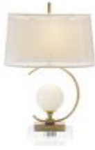
JRL-8700 26" Eclipse Table Lamp 26"H Rock crystal orb encircled in solid brass components Shade: 16x10x18x10x10 White 3 way 150 watt max type A bulb 85" harp