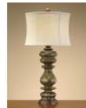
JRL-7838 33.5" Baluster W/Aged Green Finish 335"H Baluster With Aged Green Finish Shade: 16" X 165" X 11" Linen Cotton Three-Way, 150 Watt Max, Type A Bulb Disclaimer: Hand Carved