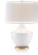
JRL-8890 27" CAROUSEL TABLE LAMP 27"H Carousel. Large white ceramic table lamp with pleated motif at top and faceted cut crystal neck. Gold wooden base. Shade: 19"x20"x12"