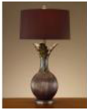
JRL-7888 34" Fern Fronds Table Lamp 34"H Fern Fronds Table Lamp Shade: 17" X 18" X 10" Charcoal Brown One-Way, 60 Watt Max, Type A Bulb Also Available With California Wiring