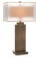
JRL-9079 29" Zen Table Lamp 29"H Zen Table Lamp. Rectangular etched ancient chinese calligraphy resin antique finish table lamp. Shade: (17x12)x(17x12)x10" Champagne. 1 Way,