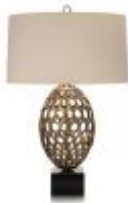
JRL-9118 35.5" Dream Weaver Table Lamp 35.5"H Dream Weaver Table Lamp. **LONG DESC **. Shade: 21x22x12" Off White. 3 Way, 150 watt max type A bulb. 11.5" Harp.