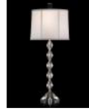
JRL-9107 33.5" Faceted Crystal Stack Buffet Lamp 33.5"H Faceted Crystal Stack Buffet Lamp. Hand cut optical crystal with brass accents. Shade: (12x9.5)x(13x10.5)x10" White. 3 Way, 150 watt