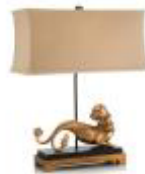
JRL-8974 25" Mythical Griffin I (Right) 25"H Mythical Griffin I (Right). Two toned gilded mythical griffin. Shade: (19"x9")x(20"x10")x9" Cream. 1 way, 60 watt max type A bulb. 7" Harp.