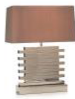
JRL-9175 28" Steel Stacks Table Lamp 28"H Steel stacks table lamp. Polished steel bars stacked on top of one another. Shade: (20x12)x(21x13)x11 Dark Grey. 3 Way, 150 watt