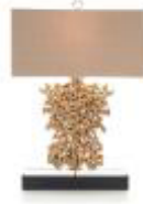
JRL-8904 28" Gold Rush 28"H Gold Rush. Large golden nugget formation task lamp mounted on a double stack base of acrylic and black. Shade: (19x9.5)x(19x9.5)x9.5"