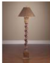
JRL-8002 70" Classical Column W/ Twist Rustic 70"H Classical Column With Twist, Rustic Shade: 8" X 23" X 14" Hand-Finished Gold And Black Three Way, 150 Watt Max, Type A Bulb