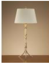
JRL-8176 36.5" Wrapped Brass Reeds Lamp 36.5"H Wrapped Brass Reeds Lamp Shade: 12" X 16" X 10" Natural Eggshell Three-Way, 150 Watt Max, Type A Bulb Also Available With California