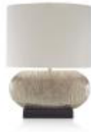
JRL-8886 27" Tree Of Life Table Lamp 27"H. Tree of Life table lamp. Large oval disc shaped table lamp with an exaggerated wood grain finish. Shade: (20"x13")x(20"x13")x14" White. 3