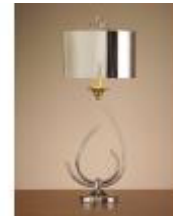
JRL-8267 33" Stylized Chrome & Brass Lamp 33"H Stylized Chrome And Brass Lamp Shade: 13" X 13" X 85" Chrome One-Way, 60 Watt Max, Type A Bulb Also Available With California Wiring