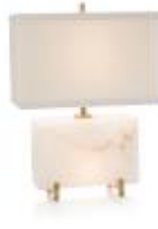
JRL-9198 24" Alabaster Horizontal Block Tble Lamp 24"H Alabaster horizontal block table lamp. Carved block of alabaster with brass accents. Shade: (10x17)x(10x17)x11" White. 1 Way, 60 watt max