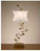
JRL-8264 36" Right Brass Branch Lamp 36"H Right Brass Branch Lamp With Crystal Leaves And Berries Shade: 135" X 135" X 875" Cloud Cream One-Way, 60 Watt Max, Type A Bulb