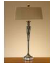
JRL-7883 335" Giocommetti Figure Male Lamp 335"H Giacometti Figure Male Lamp Shade: (65" X 16") X (7" X 18") X 75" Light Gold One-Way, 40 Watt Max, Type A Bulb Also Available With