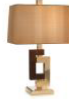
JRL-9000 25" Opposites Attract Table Lamp 25"H Opposites Attract Table Lamp. Intersecting brass and wood brackets with brass base. Shade: (15x10)x(16x11)x10" Bronze. 3 way, 150 watt max