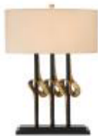
JRL-9209 31.5" Brass Ribbons Table Lamp 31.5"H Brass Ribbons table lamp. Ribbon shaped columns with antique brass finish. Shade: (22x11)x(22x11)x10" Cream. 3 Way, 150 watt max