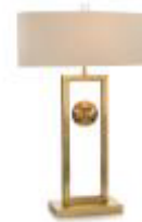
JRL-9091 33.5" The Floating Orb Table Lamp 33.5"H The Floating Orb Table Lamp. **LONG DESC** . Shade: (22x9)x(22x9)x8" Beige. 1 Way, 60 watt max type A bulb. 7" Harp.