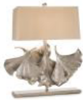
JRL-9012 32" Falling Ginkgos Table Lamp 32"H Falling Ginkgos Table Lamp. Nickel plated Ginkgo sculptured table lamp with nickel base. Shade: (21x13)x(22x14)x11" Oyster. 3 way, 150