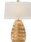
JRL-8938 26" Midas Ripple Gold 26"H Midas Ripple Gold. Broken gold leaf over gold painted casting. Shade: (16"x10")x(18"x10")x10" White. 3 way, 150 watt