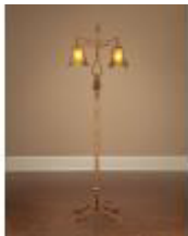
JRL-8188 72" 2 Arm Art Glass Floor Lamp 72"H Two Arm Art Glass Floor Lamp Shade: (4" X 4") X (75" X 75") X 8" Glass One-Way, 60 Watt Max, Type A Bulb