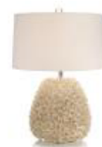
JRL-9138 29" All Frills Table Lamp 29"H All Frills Table Lamp. Pearlized glazed ruffle lamp. Shade: 19x20x11" Off White. 3 Way, 150 watt max type A bulb. 10" Harp.