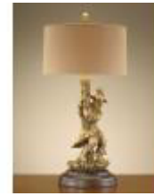
JRL-7541 33" Hf Jack & Beanstalk Comp Lamp 33"H Hand-Finished Jack And The Beanstalk Lamp Shade: 17" X 18" X 10" Cornhusk One-Way, 60 Watt Max, Type A Bulb Also Available With