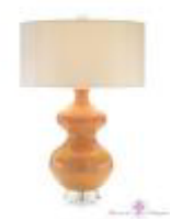
JRL-8870 30" Persimmon Gourd Table Lamp 30"H. Persimmon Gourd. Contemporary persimmon graduated gourd lamp in ceramic on an acrylic footed base. Shade: 20"x20"x10" Off White. 3