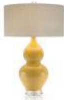
JRL-8791 32.5"H Ocher Double Gourd Ceramic Lamp 32.5"H Ocher crackle glaze over ceramic with acrylic components . Shade: 20x20x10 off white. 3 way 150 watt max type A bulb. 7.5" harp.