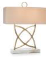
JRL-9212 30" Celtic Star Table Lamp 30"H Celtic star table lamp. Brass and stone table lamp with an angled silver finish. Shade: 24x14x9.5" Light grey. 3 Way, 150 watt max type