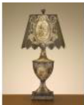
JRL-7651 215" Mini Toil Table Lamp 215"H Mini Toil Table Lamp Shade: 65" X 11" X 8" Brown Metal Toil One-Way, 25 Watt Max, Type A Bulb Also Available With California Wiring