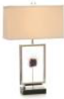
JRL-9245 27.5" Crystal Window Table Lamp 27.5"H Crystal window table lamp. Amethyst Geode mounted in a window of Nickel. Shade(16.5x9)x(17x9.5)x9.5" Cream W/Silver