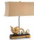
JRL-8975 25" Mythical Griffin II (Left) 25"H Mythical Griffin II (Left). Two toned gilded mythical griffin. Shade: (19"x9")x(20"x10")x9" Cream. 1 way, 60 watt max type A bulb. 7" Harp.