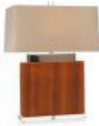
JRL-8935 30" Orange Snake Skin Block 30"H Orange Snake Skin Block. Orange faux leather wrapped block with nickel plated neck and acrylic base. Shade: (21"x13")x(22"x14")x11"