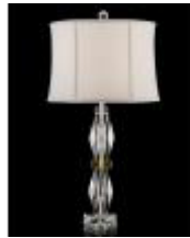
JRL-9111 34" Bright Sun Accent Lamp 34"H Bright Sun Accent Lamp. Optical crystal clear with gold optical crystal accent. Shade: 16x17x12" Off White. 3 Way, 150 watt max type A