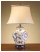
JRL-7398 28" Hf Floral Pottery/Wd Lamp 28"H Hand-Finished Floral Pottery And Wood Lamp Shade: 12" X 18" X 12" Oyster With Trim Three-Way, 150 Watt Max, Type A Bulb Also