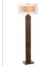
JRL-9078 64" Zen Floor Lamp 64"H Zen Floor Lamp. Rectangular ancient chinese calligraphy etched resin antique brass finish floor lamp. Shade: (17x12)x(17x12)x10" Champagne. 1