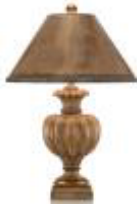
JRL-8023 325" Fluted Tuscan Cream Urn Lamp 325"H Fluted Tuscan Cream Urn Lamp Shade: 8" X 22" X 13" Hand-Finished Black Three Way, 150 Watt Max, Type A Bulb Also Available With