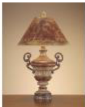
JRL-7997 38" Red Crusted Iron Arms 38"H Red Crusted Iron Arms Shade: 14" X 23" X 8" Red With Gold Leaf Pattern Three Way, 100 Watt Max, Type A Bulb Also Available With