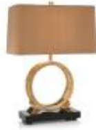
JRL-8950 29" Rings Of Eternity 29"H Rings of Eternity. Honey brass rings mounted on a black glass base. Shade: (19"x11")x(20"x12")x11" Gold. 3 way, 150 Watt