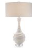
JRL-8914 33" Vanilla Swirl Lamp 33"H Vanillas Swirl. Baked enamel over aluminum/acrylic. Shade: 20"x20"x10" Off white. 3 way 150 watt max, type A bulb. 7.5" Harp.