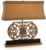
JRL-8976 25.5" Antique Medallion 25.5"H Antique Medallion. Antique medallion. Shade: (21"x9")x(23"x9")x10" Cream. 1 way, 60 watt max type A bulb. 7" Harp.