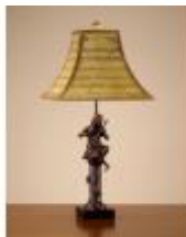
JRL-8236 24" Musical Cherub With Lyre 24"H Musical Cherub With Lyre Shade: (5" X 5") X (12" X 12") X 10" Musical Notes One-Way, 60 Watt Max, Type A Bulb Also Available With