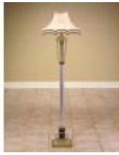
JRL-7403 61" Brs/Acr/Gls Column Floor Lamp 61"H Brass, Acrylic And Glass Column Floor Lamp Shade: 6" X (165" X 165") X 10" Oyster One-Way, 100 Watt Max, Type A Bulb Floor Switch Also