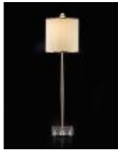
JRL-8865 33" Metropolis Candlestick Table Lamp 33"H Metropolis Candlestick. Contemporary brass buffet lamp featuring a sleek tapered center pole resting on a brass plate mounted on an acrylic