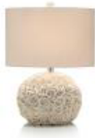
JRL-9229 22" Ribbon Cluster Table Lamp 22"H Ribbon cluster table lamp. Composition in the form of a cluster of ribbons. Shade: (16x10)x(16x10)x11" Cream. 3 Way, 150 watt max