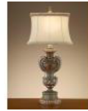
JRL-7898 345" Silvered Caledon Shield Lamp 345"H Silvered Caledon Shield Lamp Shade: (7" X 14") X (11" X 16") X 1075" French Beige Three-Way, 150 Watt Max, Type A Bulb Also