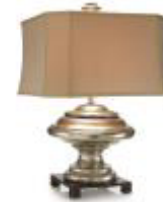
JRL-8994 30.5" Silver Orbis Table Lamp 30.5"H Silver Orbis Table Lamp. Silver gilded table lamp imitates it's own finial in grand scale. Shade: (19.5x19.5)x(20.5x20.5)x12" Gray. 3 way, 150