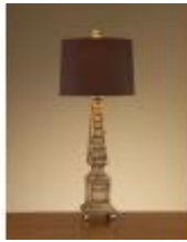
JRL-8067 37.5" Mother Of Pearl Obelisk 375"H Mother Of Pearl Obelisk Shade: 14" X 15" X 11" Charcoal Brown Three Way, 150 Watt Max, Type B Bulb Disclaimer: Natural Mother of Pearl