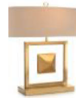
JRL-9113 26" The Floating Pyramid Table Lamp 26"H The Floating Pyramid Table Lamp. **LONG DESC **. Shade: (22x9)x(22x9)x8" Beige. 1 Way, 60 watt max type A bulb. 7" Harp.