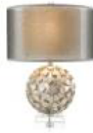
JRL-9153 25" 3D Art Globe Accent Lamp 25"H 3D Art Globe Accent Lamp. 3D art globe gilded with antiqued silver leaf. Shade: 17x17x10" Grey Organza. 3 Way, 150 watt max type A bulb.