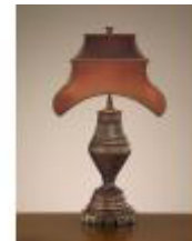
JRL-7614 305" Wood & Copper Table Lamp 305"H Wood And Copper Table Lamp Shade (75" X 75") X (15" X 15") X 12" Rust Three-Way, 150 Watt Max, Type A Bulb Disclaimer: Hand Hammered