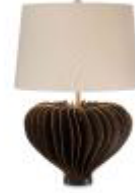
JRL-9158 32" Artist Designed Brutalist Lamp 32" H Artist Designed Brutalist Lamp. Hand stamped iron with accents of melted copper. Shade: 18x21x13" Oat. 3 Way, 150 watt max type