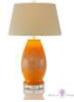
JRL-8770 33"H SUNBURST TABLE LAMP 33"H Lacquer is one of the great marvels that was brought from the Orient This lacquered lamp is a beauty It is even enhanced with little gold sparkle