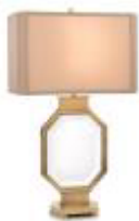
JRL-9093 29" The Asscher Table Lamp 29"H The Asscher Table Lamp. **LONG DESC** . Shade: (16.5x10)x(16.5x10)x11" Beige. 3 Way, 150 watt max type A bulb. 9" Harp.